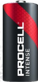
Size: C (LR14) PX1400