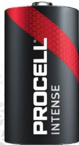
Size: D (LR20) PX1300